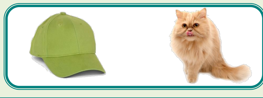
Back/bag, mouth/mouse, bus/bun,bed/bell, lock/log, cloth/clock. mat/man, bike/bite, knight/knife, wash/watch, pin/pill, can/cat, map/man, gum/gun, cap/cat