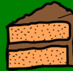
piece of cake