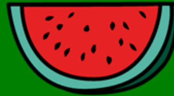
slice of watermelon