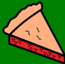
slice of cherry pie