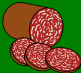
slice of salami