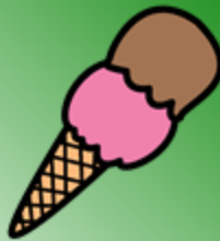
ice cream cone